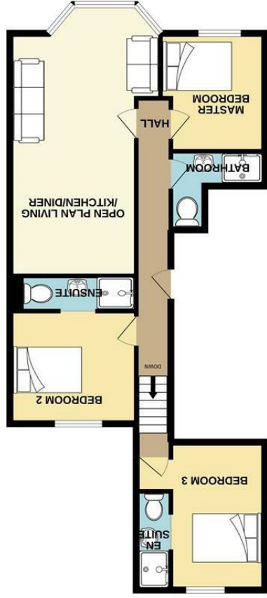
SECOND FLOOR 807 sq.ft. (75.0 sq.m.) approx.

While every attempt has been made to ensure the accuracy of the figures contained here, measurements of doors, windows, rooms and any other items are approximate and no responsibility is taken for any errors, omissions or mis-statements. This plan is for illustrative purposes only and should be used as such by any prospective purchaser. The services, systems and appliances shown have not been tested and no guarantee as to their operability or efficiency can be given. Made with AutoCAD 2022